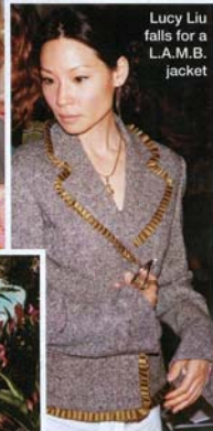
Lucy Liu falls for a L.A.M.B. jacket

after her successful collaboration with LeSportsac, Gwen is planning a range of L.A.M.B. handbags for 2006. (Not to mention Harajuku Lovers, her just-launched line of accessories and casual wear.)