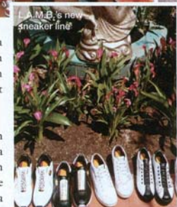
L.A.M.B.'s new sneaker line